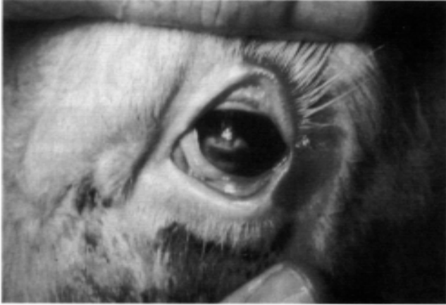
Figure 1. Severe corneal opacity and central corneal ulceration in a steer with pinkeye; approximately eight days duration.

cornea in about two days, and by day six the entire cornea will have a gray-white to yellow color with deep central ulceration of the cornea (Figure 1). Severe ulceration and corneal rupture with loss of eye contents, cone-shaped bulging of the eye, and blindness are infrequent outcomes of pinkeye. More often, complete recovery occurs in three to five weeks, with only a few affected eyes having a persistent white scar on the cornea.